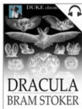
Dracula Bram Stoker

Once the book is checked out to you, it will appear under “Check Outs” in your account. Click the “Download” button. All